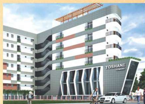
Toshani Towers Kalambagh Chowk, Muzaffarpur