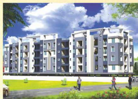
Pushpanjali Apartment Danapur-Khagaul Road, Patna