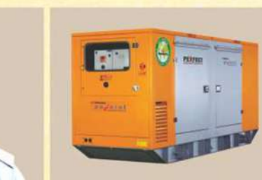
24 X 7 Power Back up