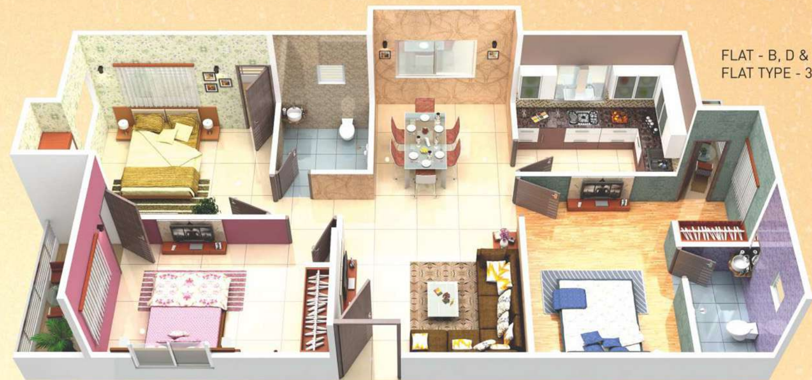
FLAT - B, D & H FLAT TYPE - 3 BHK