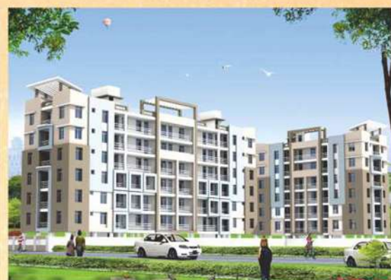
Mundeshwari Sapphire Danapur-Khagaul Road, Patna