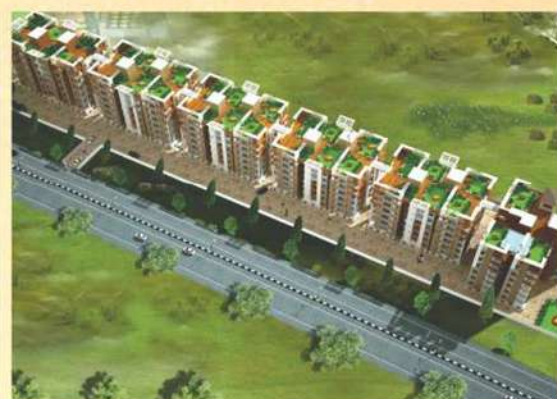
Terrace Gardenia Ashiana Nagar, Patna