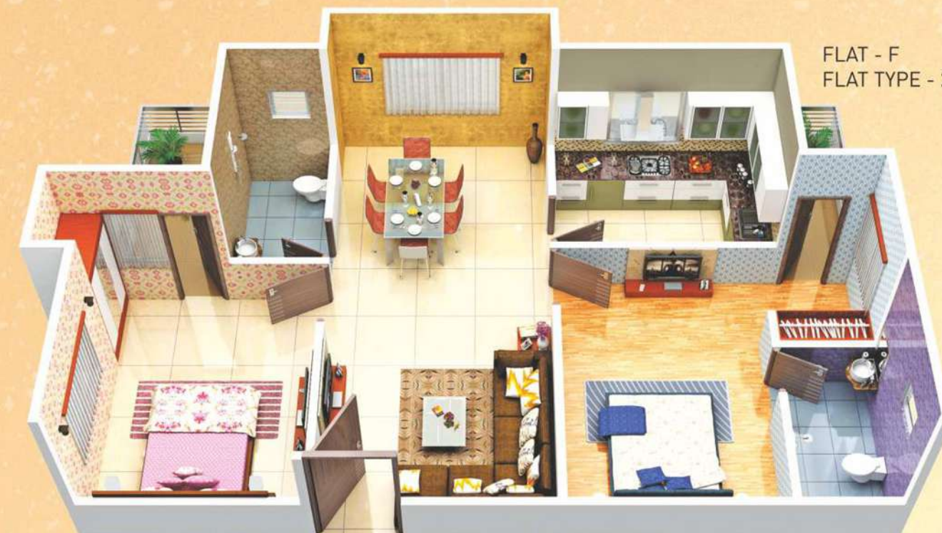
FLAT - F FLAT TYPE - 2 BHK