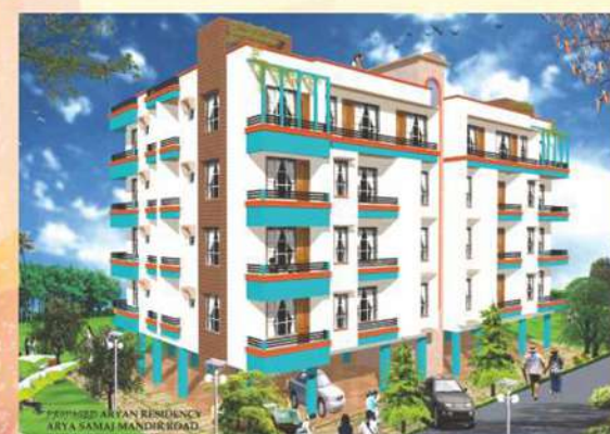
Aryan Residency RPS More, Patna