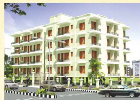
Patliputra Gardens New Patliputra Colony, Patna