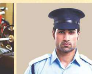
Round the clock security managed by an advance security system