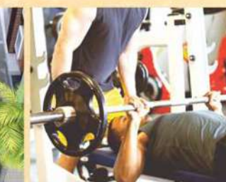
Club House and Gymnasium