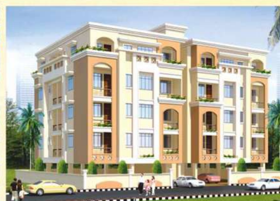
Aryan Residency - II RPS More, Patna