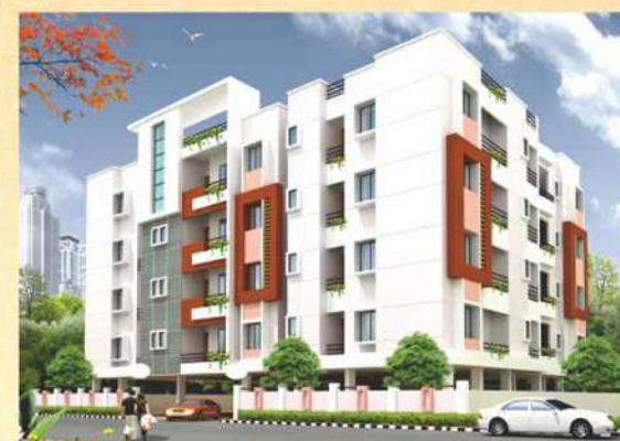
Amitabh Kunj - II Buddha Colony, Patna