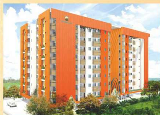
Mundeshwari Crescent Danapur-Khagaul Road, Patna