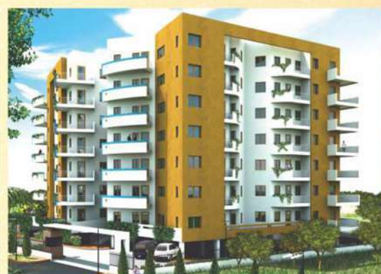
Bailey Greens Bailey Road, Patna