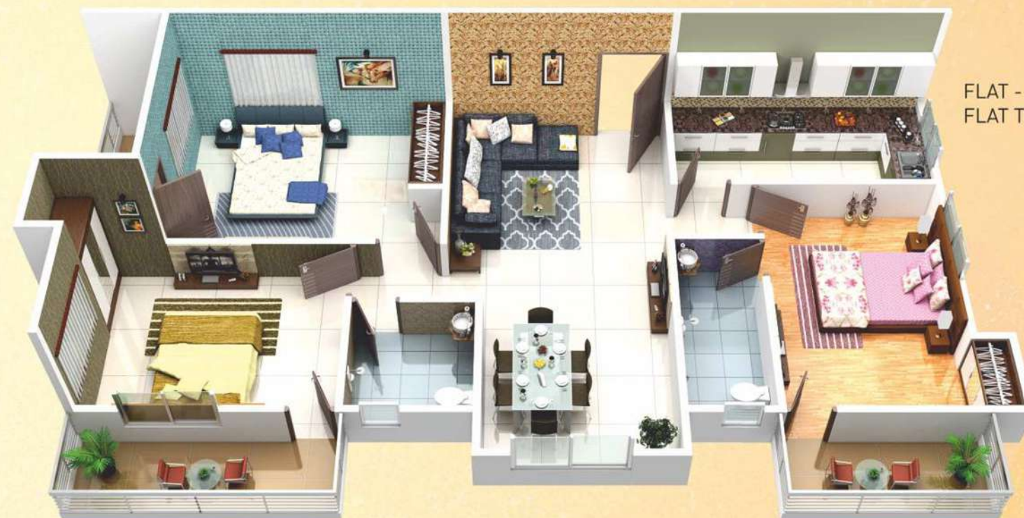
FLAT - A, C & G FLAT TYPE - 3 BHK