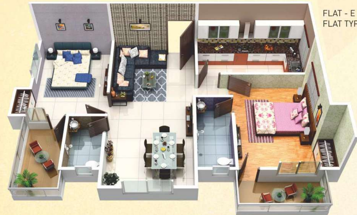
FLAT - E FLAT TYPE - 2 BHK