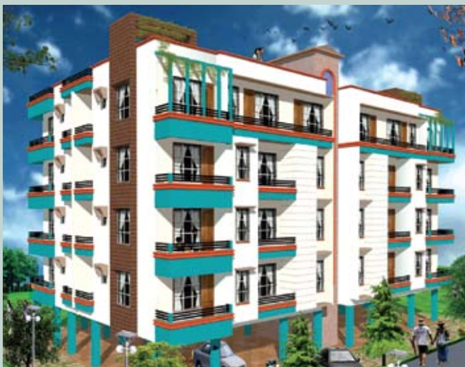
ARYAN RESIDENCY I

With an affluence of amenities within the premise, these three bedrooms, low-cost independent flat, allow you to relax and share quality time with your family in secure urban location. The design of flats is exquisitely expressed through the airy bedrooms, captivating views and contemporary touch.