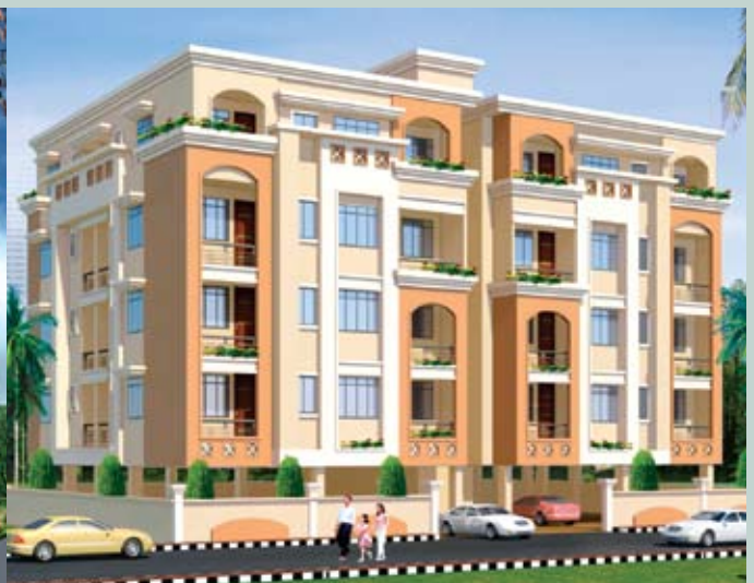
ARYAN RESIDENCY II